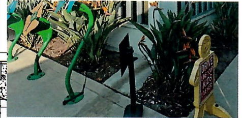
Need new mulch/top soil at planter area.